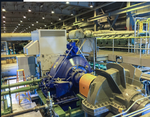
A pump, fluid coupling and motor.